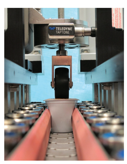
Single size pod samples (coffee) being tested in T550 C-LP w/TDLC.

The T550 C-LP sensor with TDLC worked well on these style coffee pods. The T550 C-LP sensor with TDLC was able to detect a leak size of 0.008" and larger through the container and membrane closure. Testing at higher production speeds may result in a variance of minimum leak sizes. The T550 C-LP sensor with TDLC sensor can be recommended for the inspection of most single serve coffee pod applications.